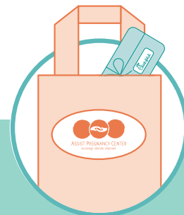
CFA Gift Card & Assist Tote Bag