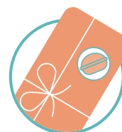
Great American Gift Card