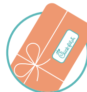
Chick-Fil-A Gift Card