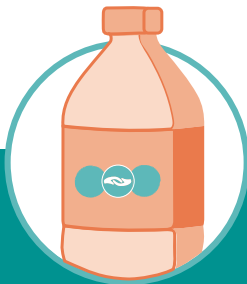
Assist Water Bottle