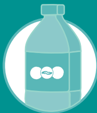
Assist Water Bottle