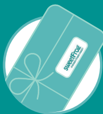
Sweet Frog Gift Card